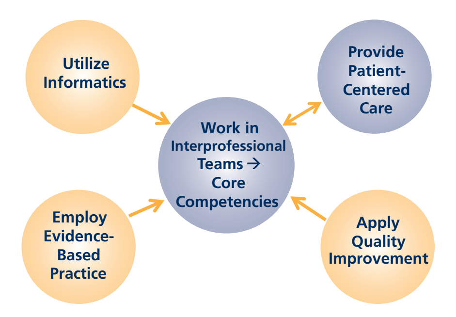
FIGURE 5: Interprofessional Teamwork and IOM CORE COMPETENCIES

Our report examines the further development of the core competency—work in interdisciplinary teams—identified in the 2003 IOM report. Although the IOM report named the key processes of communication, cooperation, coordination, and collaboration in teamwork, the interprofessional competencies that underpin these processes were not defined. Also important to the elaboration of teamwork competencies are the interrelationships with the other four IOM core competencies (see Figure 5). Provision of patient-centered care is the goal of interprofessional teamwork. The nature of the relationship between the patient and the team of health professionals is central to competency development for interprofessional collaborative practice. Without this kind of centeredness, interprofessional teamwork has little rationale. The other three core competencies, in the context of interprofessional teamwork , identify 21st-century technologies for teamwork communication and coordination (i.e., informatics), rely on the evidence base to inform teamwork processes and team-based care, and highlight the importance of continuous improvement efforts related to teamwork and team-based health care.