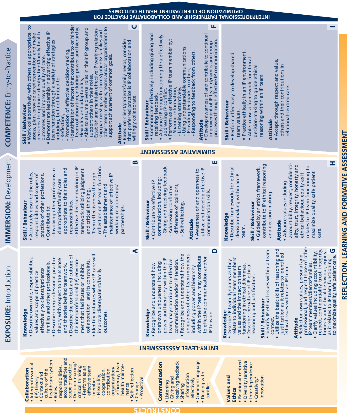
FIGURE 7: A Framework for the Development of Interprofessional Education Values and Core Competencies

Reprinted with permission from University of Toronto. (2008). Advancing the Interprofessional Education Curriculum 2009. Curriculum