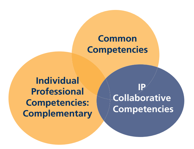
FIGURE 4: Barr's (1998) three types of professional competencies