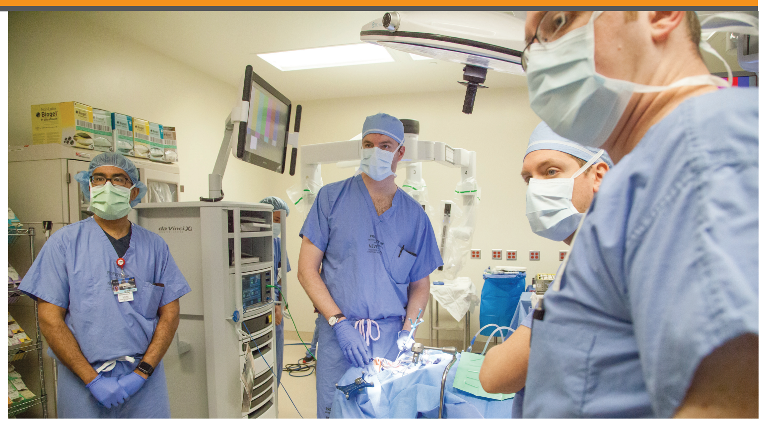
The skull base team prepares for the transoral approach to the spine.