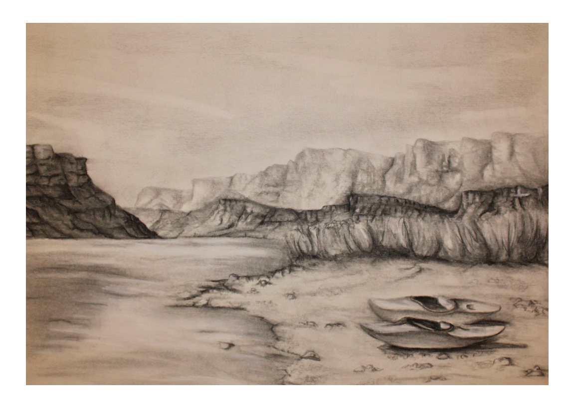
charcoal View of the Grand Canyon at Lee's Ferry