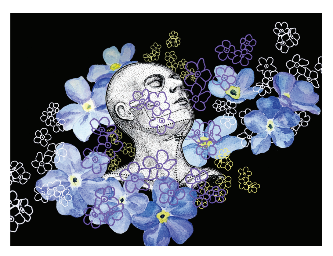
Watercolor and digital media

I sourced the central figure of the collage from our dissection manual to represent the medical knowledge that we gained from anatomy lab. The flowers, which are forget-me-nots, symbolize our endless appreciation for our donor and the lasting memories we all share from this time in our journey to becoming doctors.