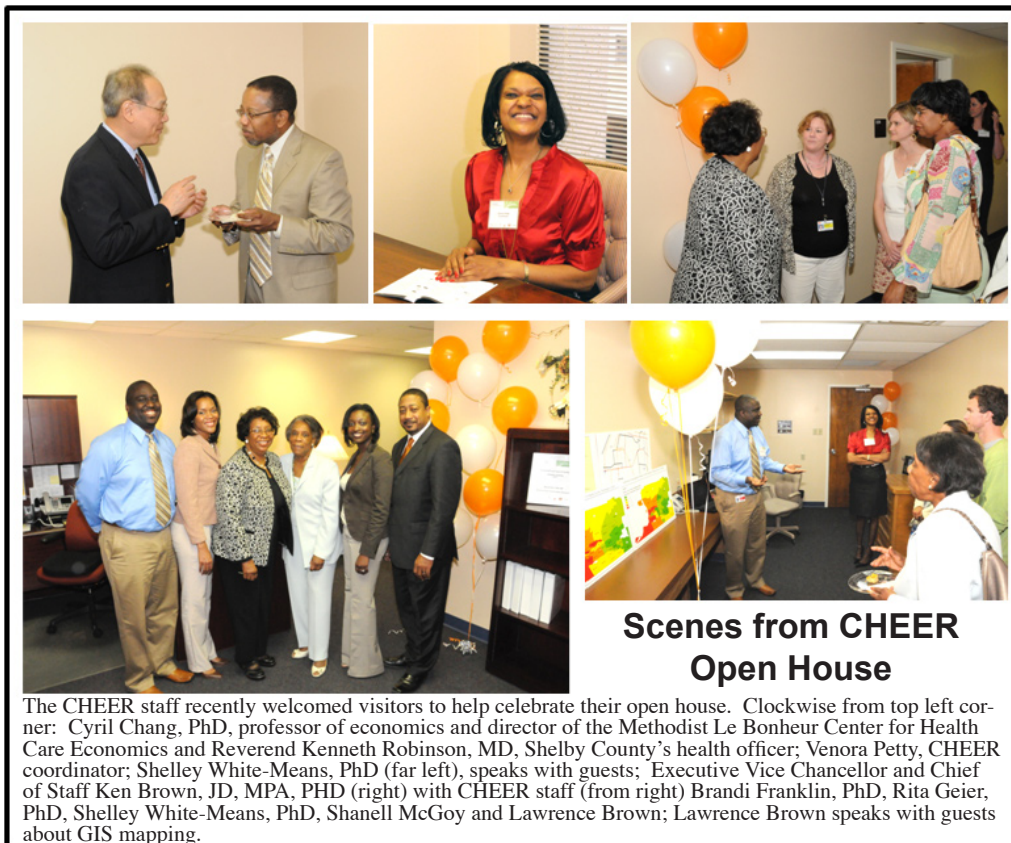
Scenes from CHEER Open House