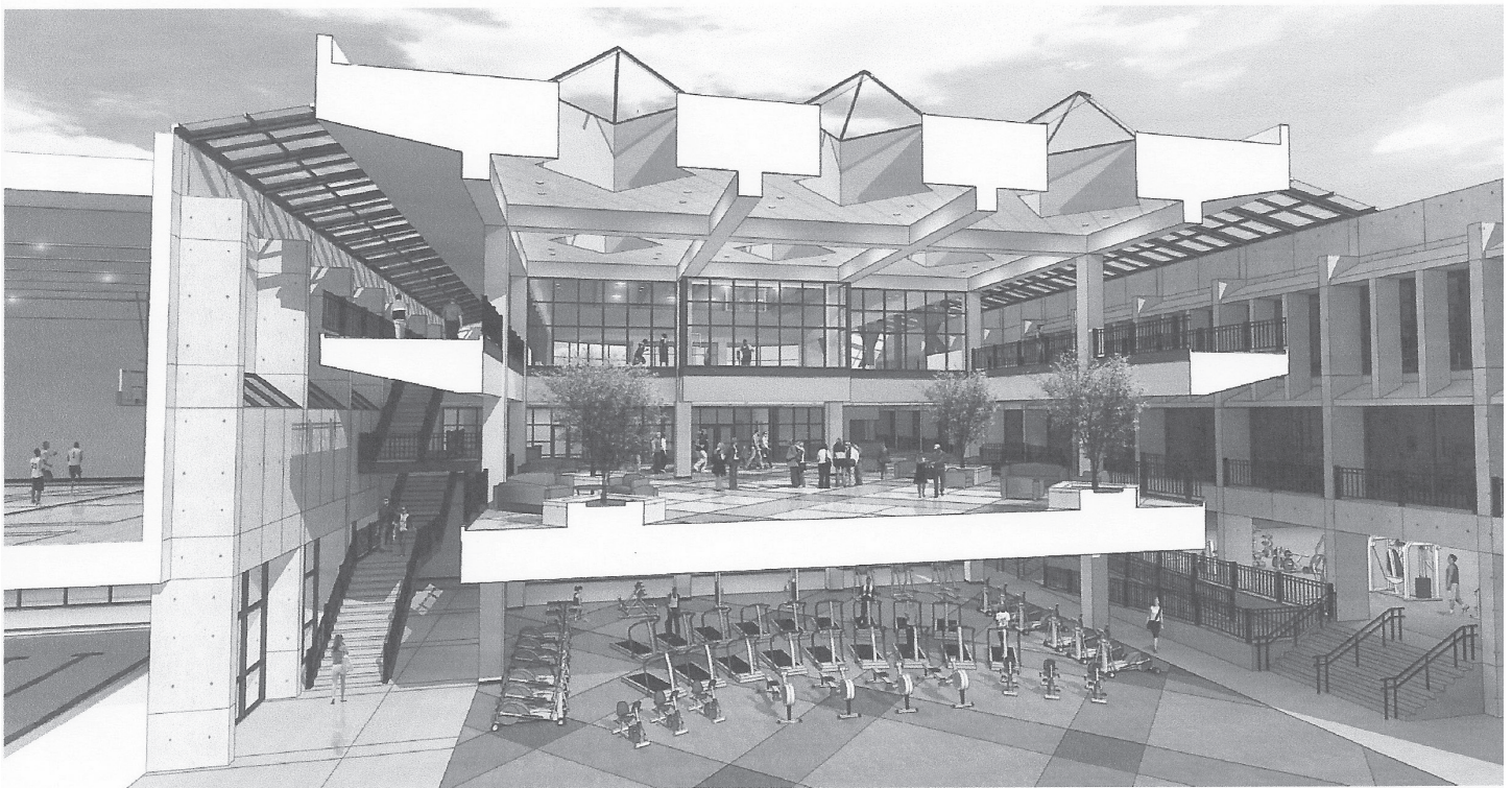
Building Section through Student Alumni Center

Architect's renderings of renovated UTHSC Student Alumni Center