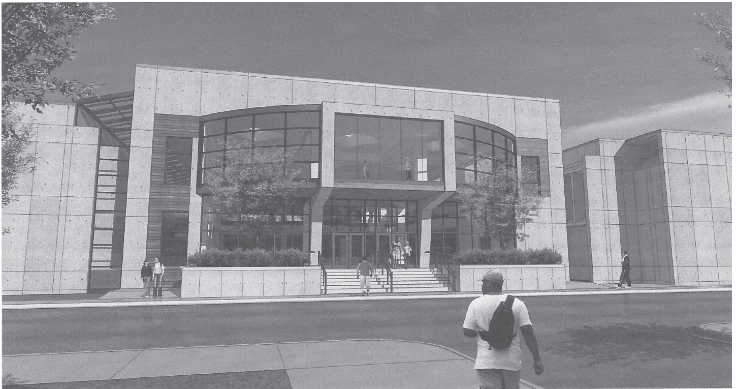
Main Entrance from Manassas Street