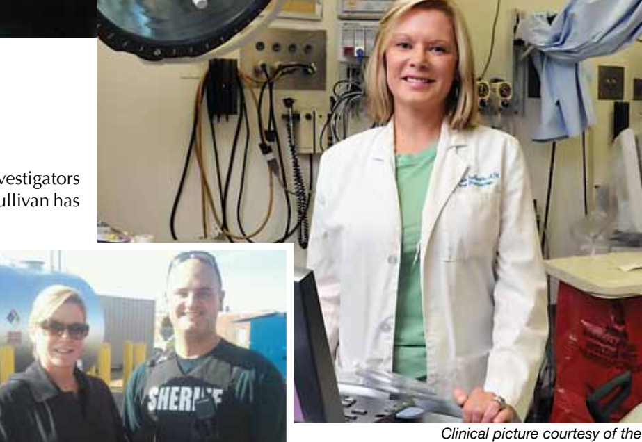
Clinical picture

As a UTMG employee, she works in trauma at the Regional Medical Center (The MED) in Memphis. She earned her